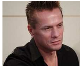
d) Larry Mullen Jr.

( ) vocals and guitar ( ) guitar, keyboards, backing vocal ( ) bass guitar ( ) drums and percussion