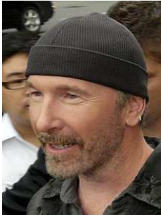
a) The Edge