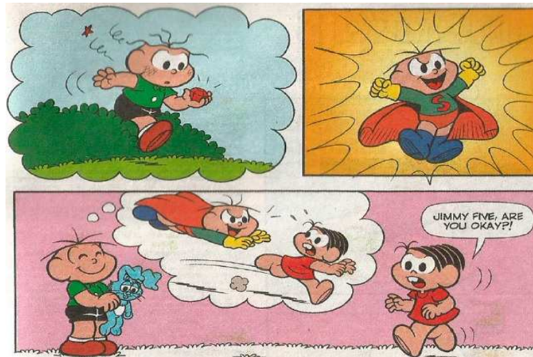
Picture 17- The color of Monica's gang strips in English

Another aspect that was observed is the comic books background color. In both magazines the predominant colors are blue, pink, yellow, white and green. When we analyzed other magazines that were written in Portuguese, we found the same feature: