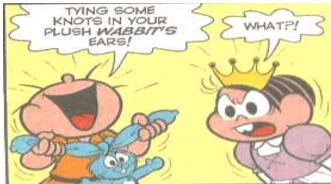
Picture 16- Monica and Jimmy Five I

example, Jimmy Five is always making plans to take Monica down and she, on the other hand, is always trying to retaliate by punching him as in the situations that were taken from our corpus :