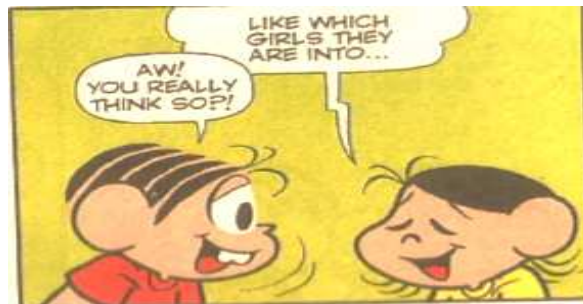
Picture 10- Monica's and Maggy's hair

Their hair is another aspect that makes a distinction between them. While Monica's hair is drawn in the way that remind us a bunch of bananas, Jimmy Five's hair is only five strands in his head, Smudge has dirty hair and Maggy has some loose strands of hair on the back of her neck: