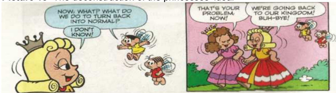
Picture 18- The deconstruction of the princesses' ideal

Mauricio de Sousa shows us the princesses in “Monica and Maggy in: Little flies” from the comic called Little flies (2012), we, with our background knowledge suppose they are innocent and kind, however, the author deconstructs this ideology previously built when he shows us that the princesses only wanted to be free from their curse, without caring about how Monica and Maggy would turn into people again, even the princesses faces show us that.