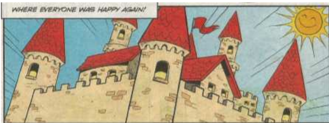
Picture 1- The simple setting of Monica's gang

Another aspect we can find in Mauricio de Sousa's strips is the simple setting. The characters and their acts are the most important characteristics of the stories, the stage around them is set there only to complement the information the writer wants to express. For example, when Mônica comes back to the castle of her family, after becoming a princess again, the storyteller tells us that everyone was happy there and, the only element which shows us this statement is the sun smiling.