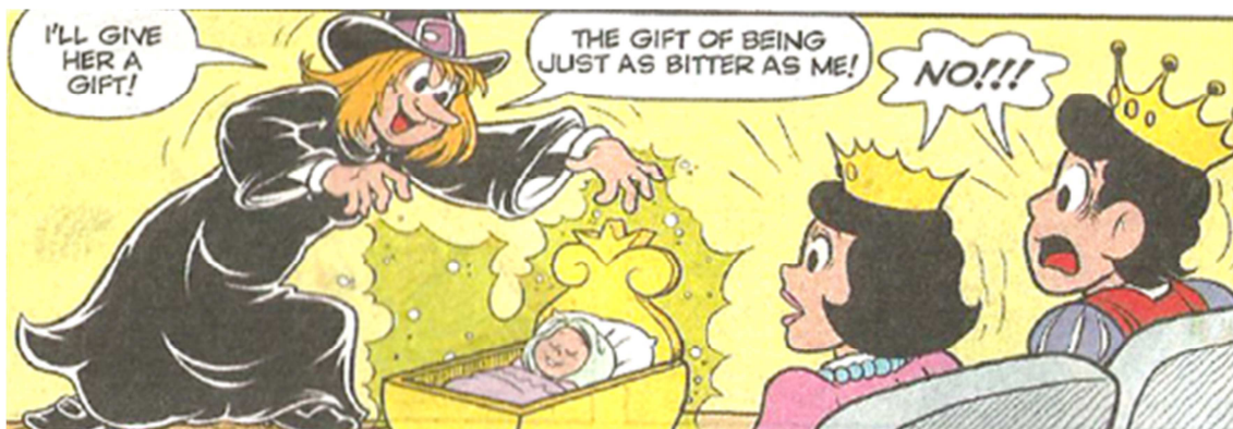
Picture 20- The princess Monica being cursed by the bitter witch

In one of the comics chosen to be analyzed in this paper, there is a strong influence of this kind of tales, as we have shown previously. "The ill-tempered princess, part I" is the story of a princess who was cursed by a bitter witch when she was still a baby because the witch did not like the idea of not being invited to a party in the kingdom.