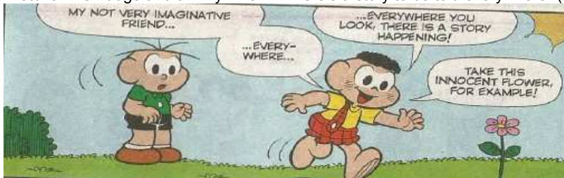
Picture 7- Smudge and Jimmy Five in “There’s a story to be told everywhere” (2014)

In the same comic, we have now the strips telling a story in which Jimmy Five and Smudge establish a long dialogue about “plenty of things going on” around the place where they are at that moment. It is named “There’s a story to be told everywhere” and, in their dialogues, we can see Smudge teaching Jimmy Five how to appreciate the little things happening around them. As it was told previously, everything is showed to the reader in a very amusing way: