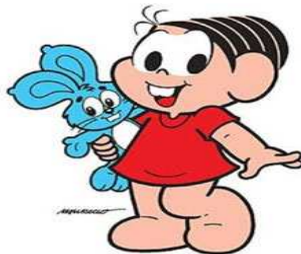
Picture 13- Monica's main characteristics

Monica, who is always chasing Jimmy Five because of his plans to take her down, was created in 1970. As we said before, Mauricio de Sousa's own daughter inspired this character in him. Most of the time we see her portrayed in her daily routine she is wearing a red dress and no shoes. The characteristics that call the readers' more attention are the facts that her two front teeth are bigger than the other ones; she is chubby and small. As Student A , said: “A Mônica é baixa, meio gorda, dentuça e se irrita facilmente, especialmente quando pegam seu coelho Sansão”: