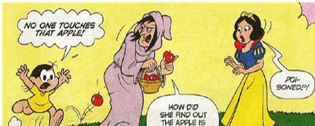
Picture 21- Snow White and Evil Queen in the comic